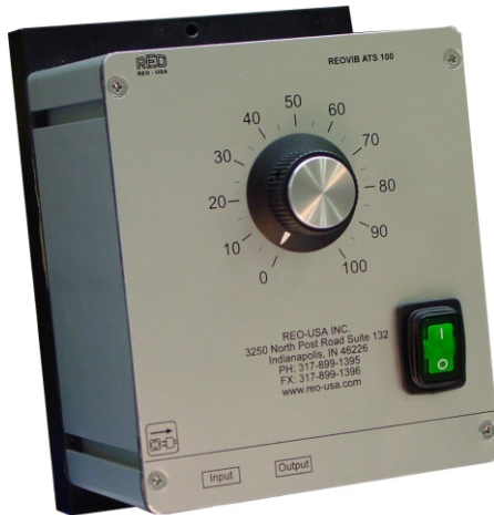
Enclosed IP 54

P/N: 604452 Input voltage: 110/240V Current: 15A Input frequency: 50/60Hz Output frequency: 60/120Hz or 50/100Hz Full Wave 3600 / Half Wave 7200 Soft Start: 0.5 seconds Protection rating: IP 54 (NEMA 12) Operating temperature: 0 - 45 degrees C Setpoint: 10k potentiometer, 0-10V dc, 0(4)-20mA Enable with: Dry set of contact, or 24V dc. CE Mark and UL listed Standards: EN 50081 - Teil1 EN 50082 - Teil2 Output power: connect to magnetic coil(s) Input power: connect to 110/240VAC Fuse: Very Fast Acting Semiconductor 16A