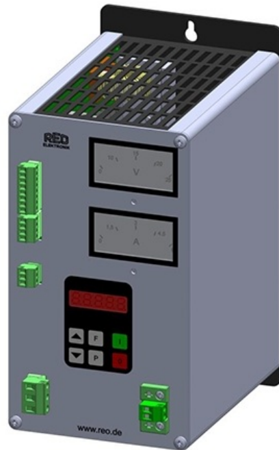
REOTRON SMP CP/M 24-5

for use in cathodic corrosion protection applications